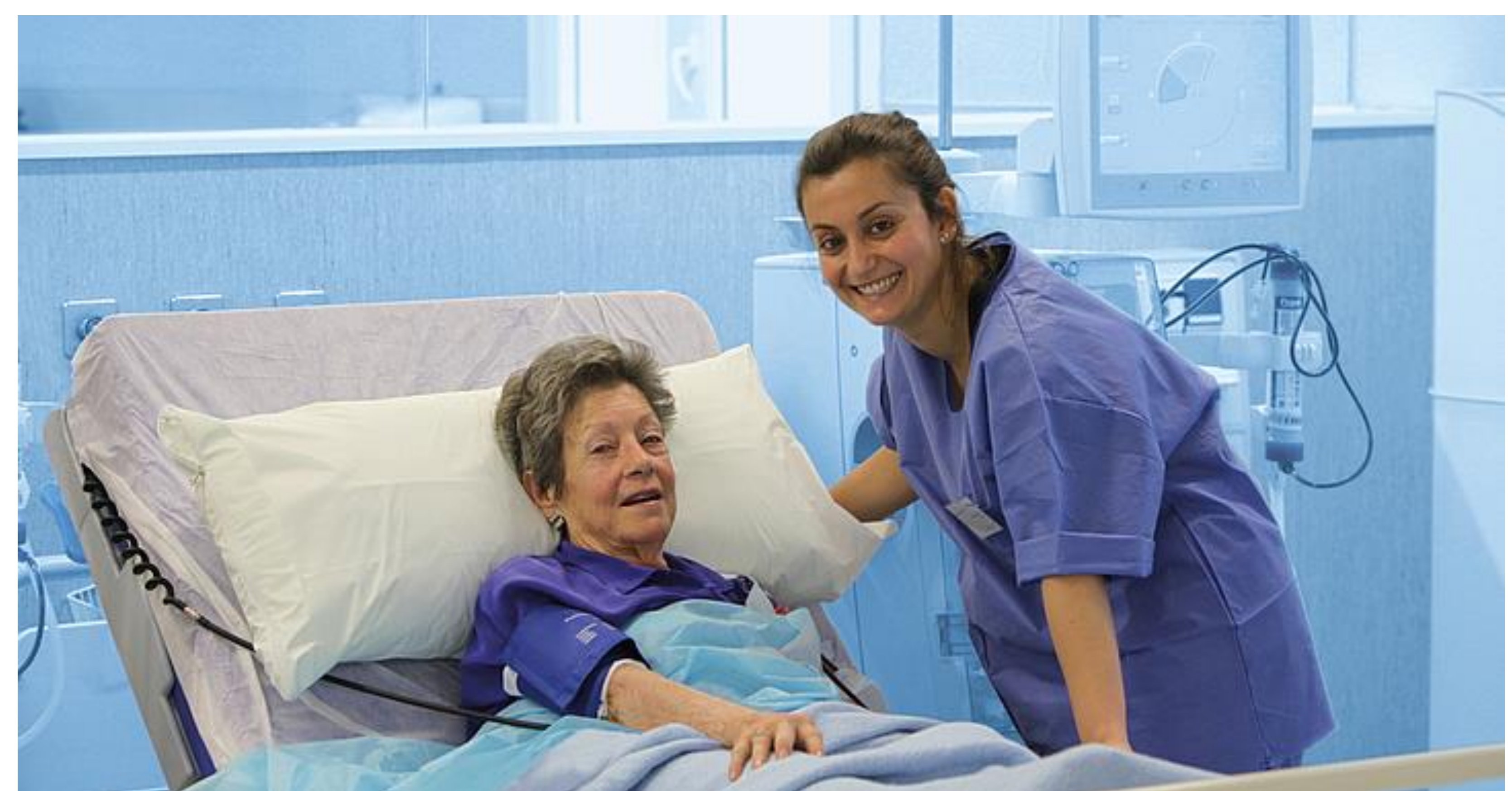
Figure 2: Nursing care dedication